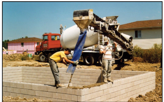
Figure 4— A Residential, Mortarless, Single-Family Basement - Part of a 520 Home Development